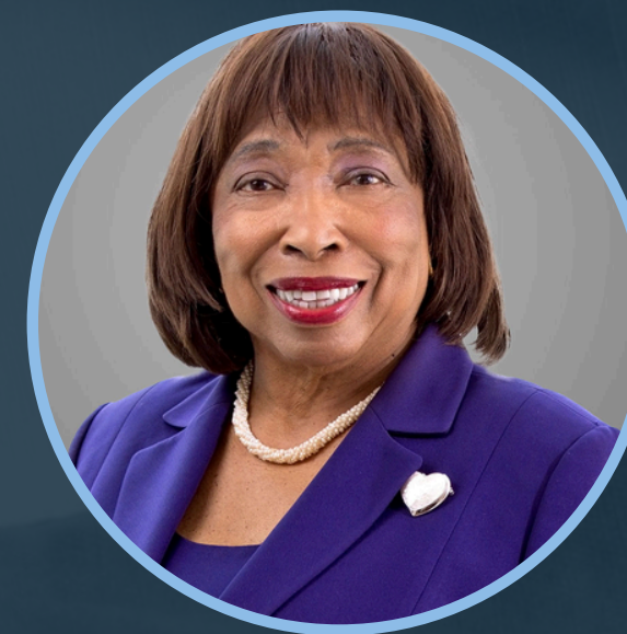
JUDGE BERNICE B. DONALD WESTERN DISTRICT OF TENNESSEE AND THE SIXTH CIRCUIT (RET.)