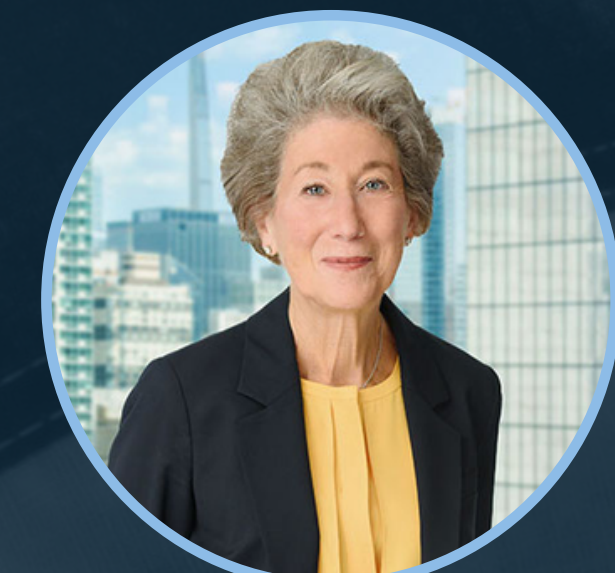
JUDGE SHIRA A. SCHEINDLIN SOUTHERN DISTRICT OF NEW YORK (RET.)