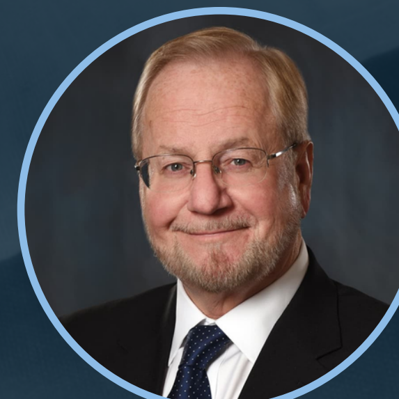
JUDGE PHILIP M. PRO DISTRICT OF NEVADA (RET.)