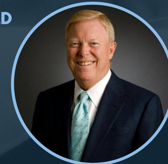
CONGRESSMAN RICHARD A. GEPHARDT FORMER HOUSE MAJORITY LEADER